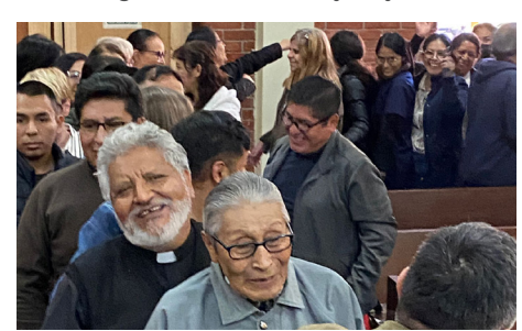
Church leaders at the seminars in Lima

interaction Indeed. worldwide church is profoundly а enriching experience for any leader. It broadens perspectives. challenges assumptions, and fosters a deeper appreciation for the diverse manifestations of God's love and grace. As the Irish delegation returns home, they carry with them not just memories of Peru but a renewed sense of purpose and a deeper commitment to serving God's kingdom wherever they may be called.